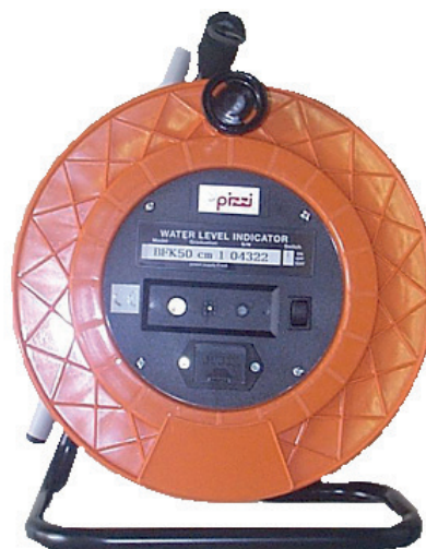
Water level meter