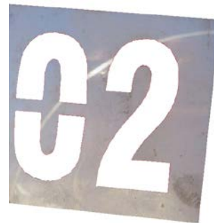
Perforated numbered plate