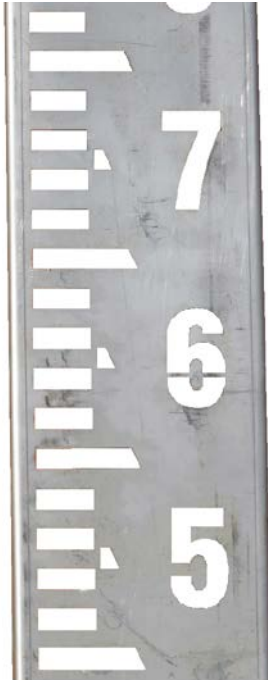
Detail of perforated staff gauge

On request staff gauges and plates are also available in perforated steel.